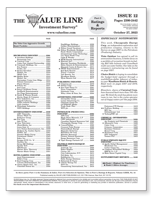
Ratings & Reports

Ratings & Reports is the core of The Value Line Investment Survey with one-page reports on all the companies we cover and one-page reports on approximately 100 industries. The company reports contain a summary describing the business, Value Line proprietary ranks, our 3- to 5-year forecasts for stock prices, income and balance sheet data, as much as 17 years of historical data, capital structure and our analysts' commentaries. They also contain stock price charts; quarterly sales, earnings, and dividend information; and a variety of other very useful material. Each page in this section is fully updated every