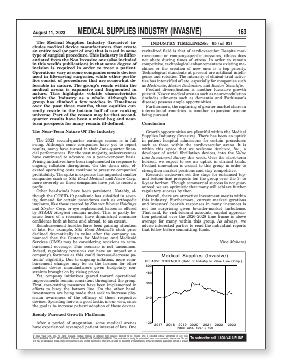
Sample Industry page

The information contained in each Industry Report may differ considerably from one industry to another, but there is a general format we follow.